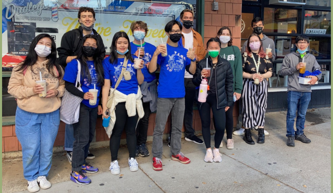
Bobahead after Fall Retreat