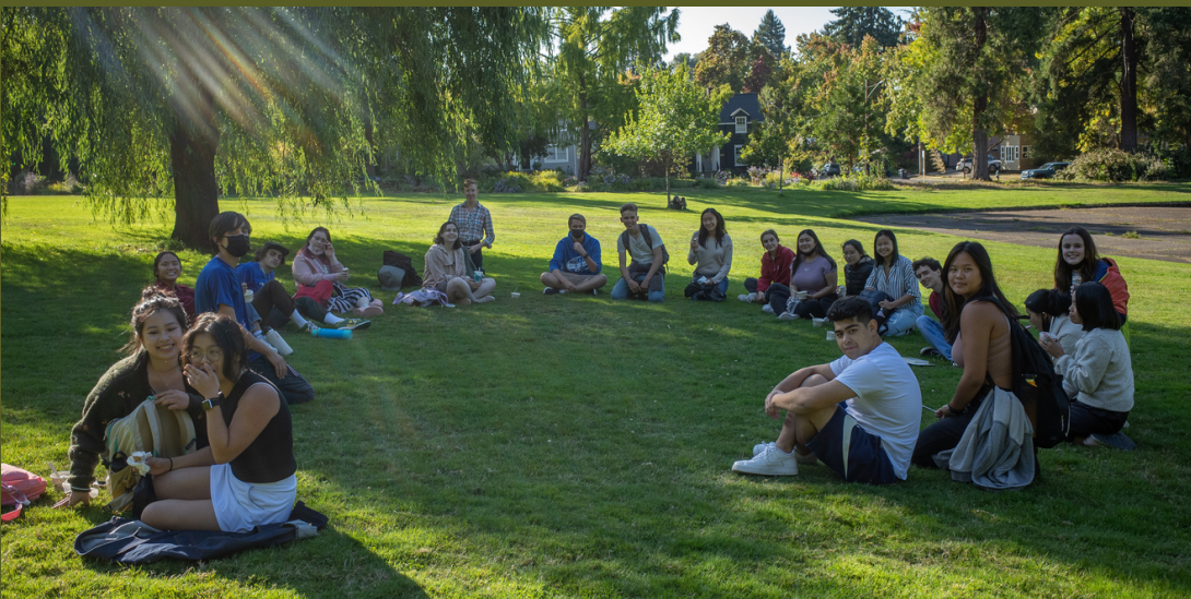
Eating Prince Puckler's at Washburne Park getting to know each other