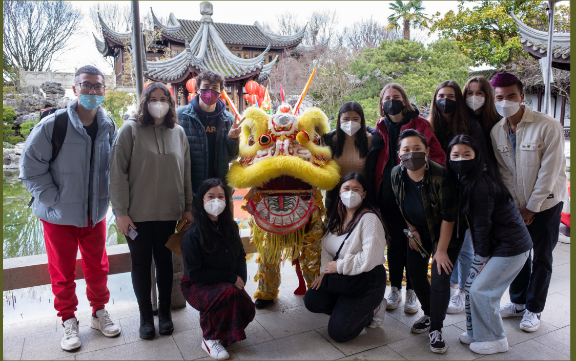
Flagship Students with a lion at the Lan Su Chinese Garden in Portland