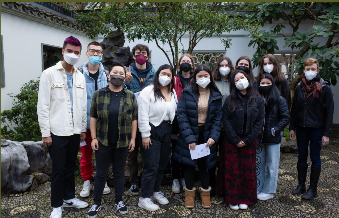
Portland Trip 2022