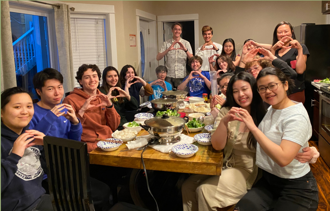
Students throwing their "O" at Spring Retreat