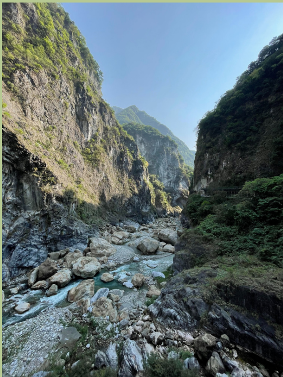
Photo from Taroko National Park, showing the variety of natural elements in Taiwan.

While in Taiwan, I went on many bike rides with a local club. I'm pictured here looking toward Taipei, with the famous Taipei 101 building in the background.