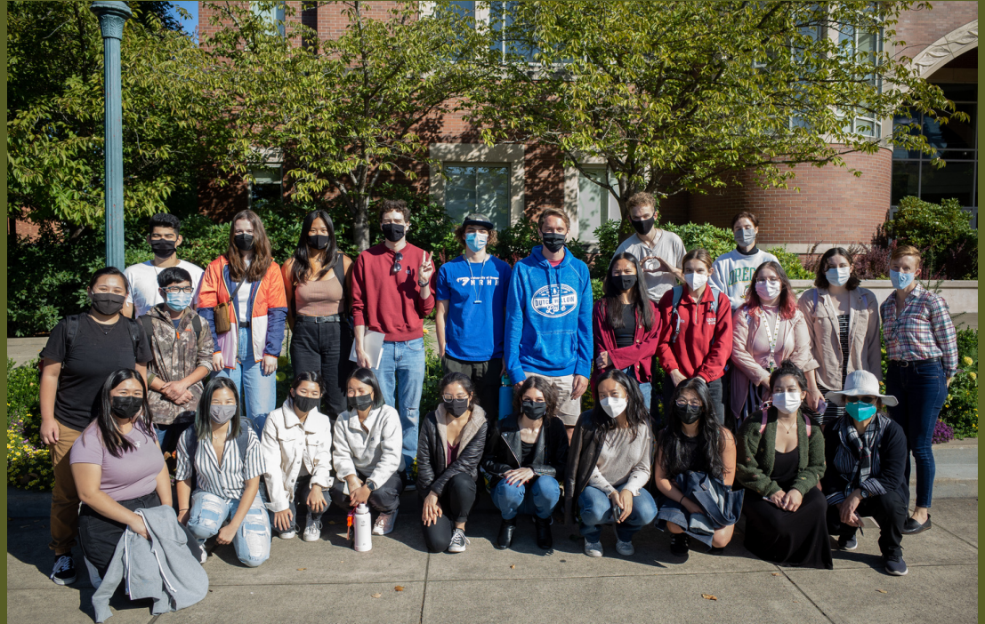
New Student Orientation group photo