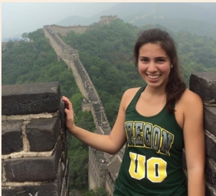
NSLI-Y summer 2015 excursion to Great Wall of China in Beijing

Looking back, I can see how 6+ years of studying Mandarin led me to venture to the Middle East. But I never could have predicted the destinations I would go to from the start. I never imagined I would travel abroad six times, the majority being completely free, or if not partially funded. So, to anyone reading this, trust the process. Keep pursuing your interests and let your curiosity take you to new places. You'll never know where you could go.