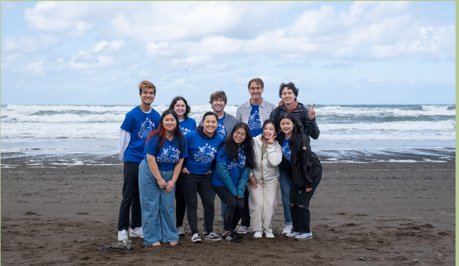
BANZHANG AT SPRING 2022 RETREAT

Banzhang is the student leadership group for the University of Oregon's Chinese Flagship Program. These students volunteer their time to plan events to foster a strong Flagship community.