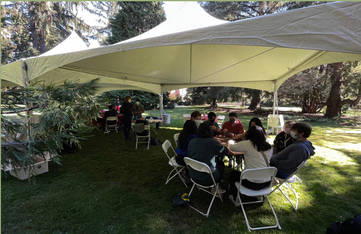
Students playing mahjong at Fall Retreat