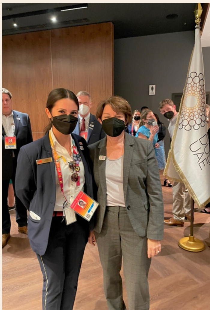
Senator Amy Klobuchar